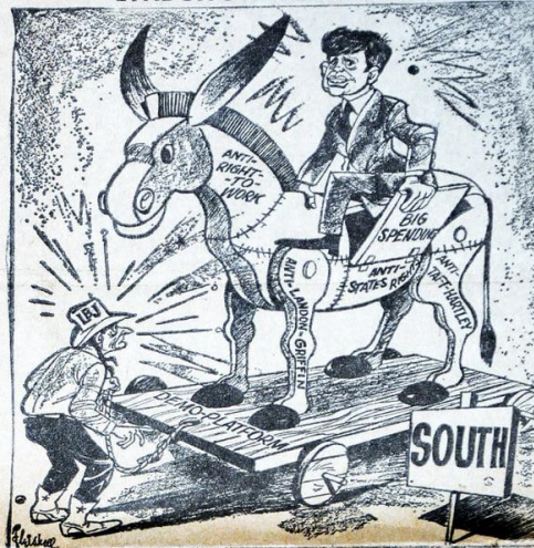
LYNDON'S TROJAN HORSE!

(This Advertisement Paid For By Clintonians For Nixon and Lodge)