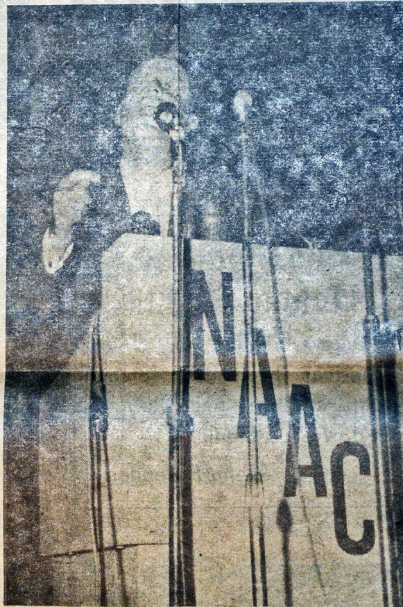
KENNEDY AT RIGHTS RALLY—Senator John F. Kennedy as he addressed NAACP sponsored civil rights rally at Shrine Auditorium in Los Angeles, just four days before he secured Democratic nomination. All other candidates spoke or were represented. A walloping crowd of 7,000 attended the three and a half hour NAACP rally.

The right of every American to think, to speak, to read, to worship as he pleases.