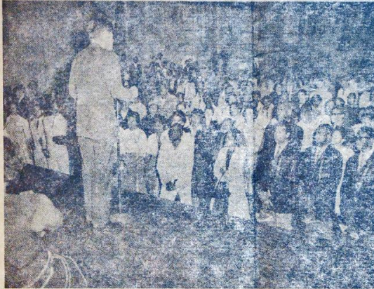
SENATOR KENNEDY TALKING WITH STUDENTS at Bluefield State Teachers College, Bluefield, W. Va., during his whitewind primary swing through West Virginia. This meeting was sponsored by the West Virginia for Kennedy Committee.