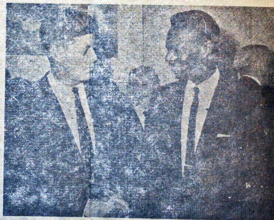
SENATOR KENNEDY, "Champion of Human Rights," talks politics with his friend, Nat "King" Cole, "Champion of Entertainers."